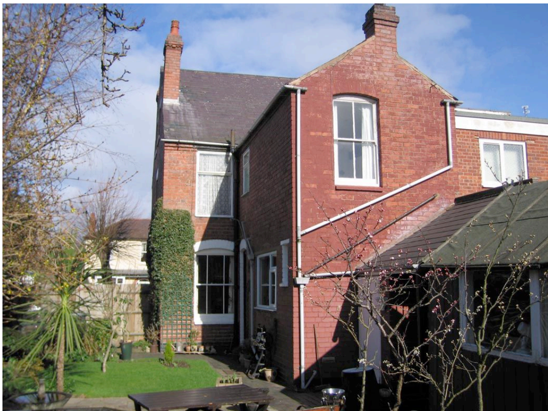
Rear of number 37