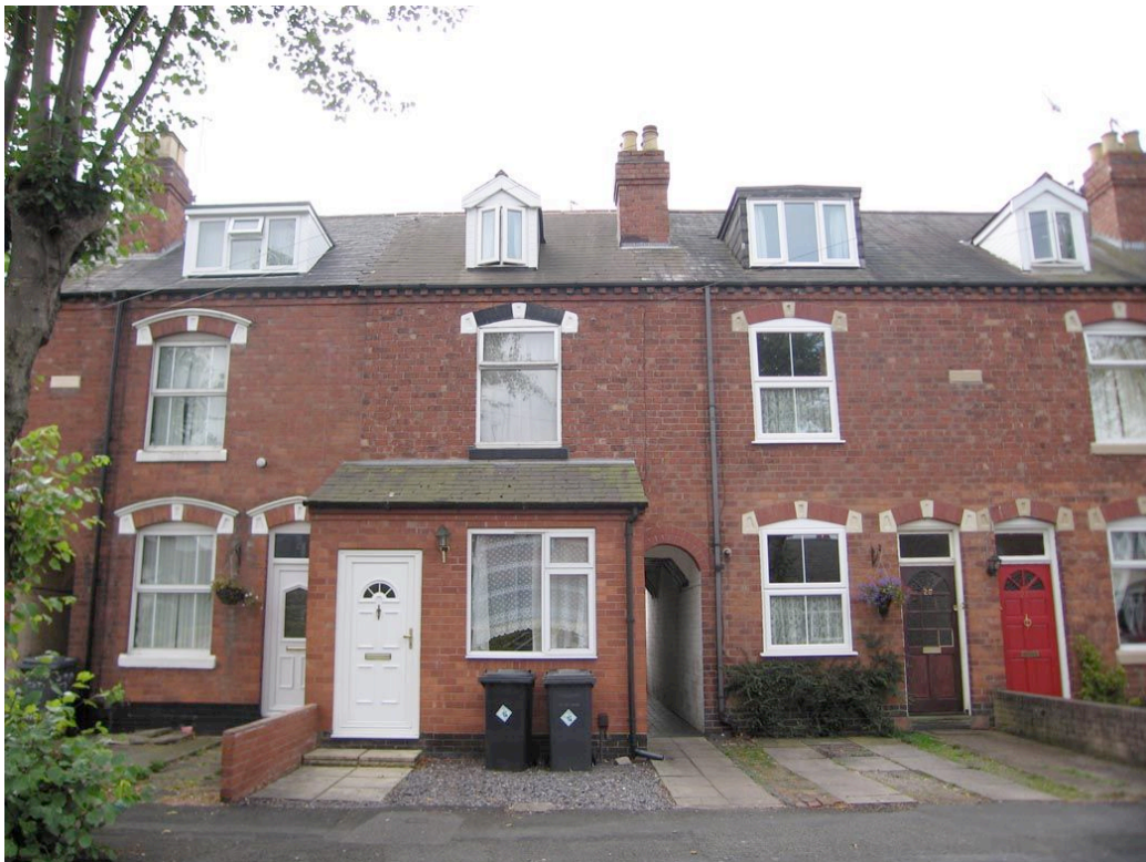
24-27 Northumberland Avenue 2007