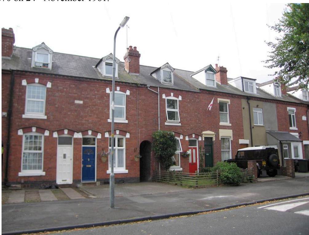
30-34 Northumberland Avenue 2007