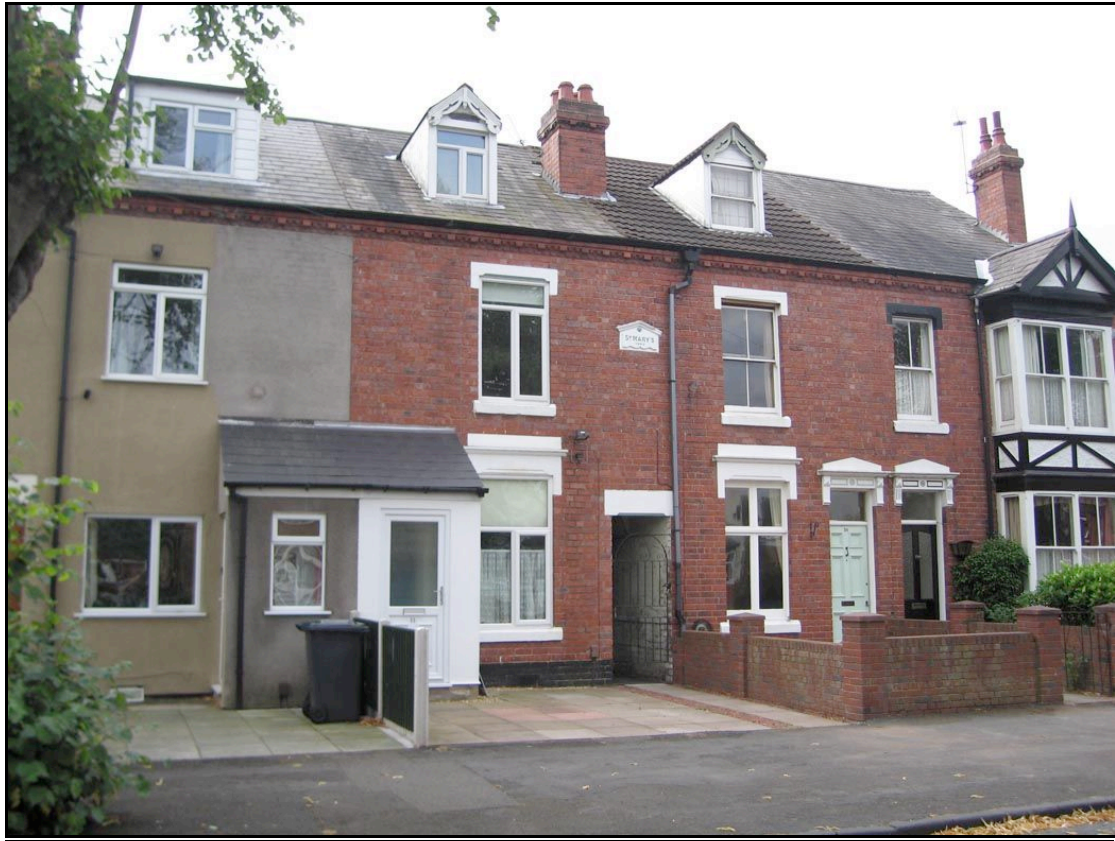
34-37 Northumberland Avenue 2007