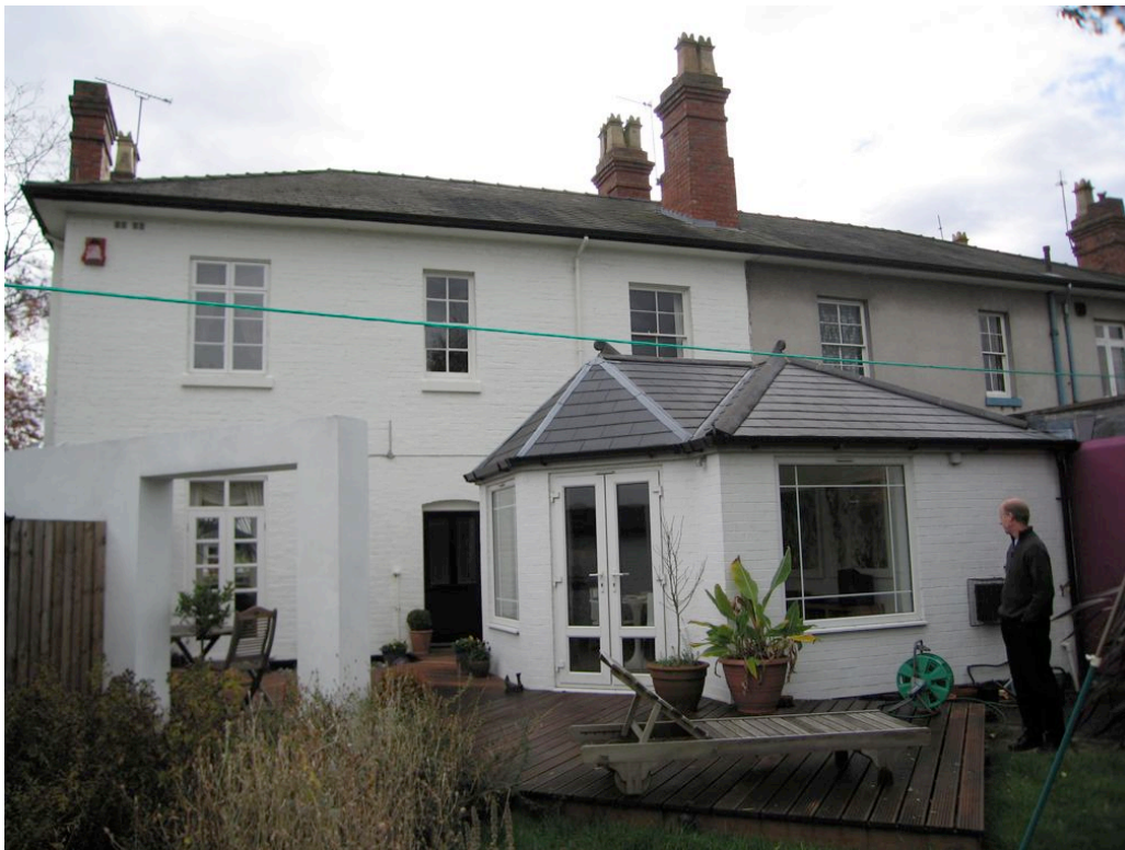
Rear of 146 Hurcott Road