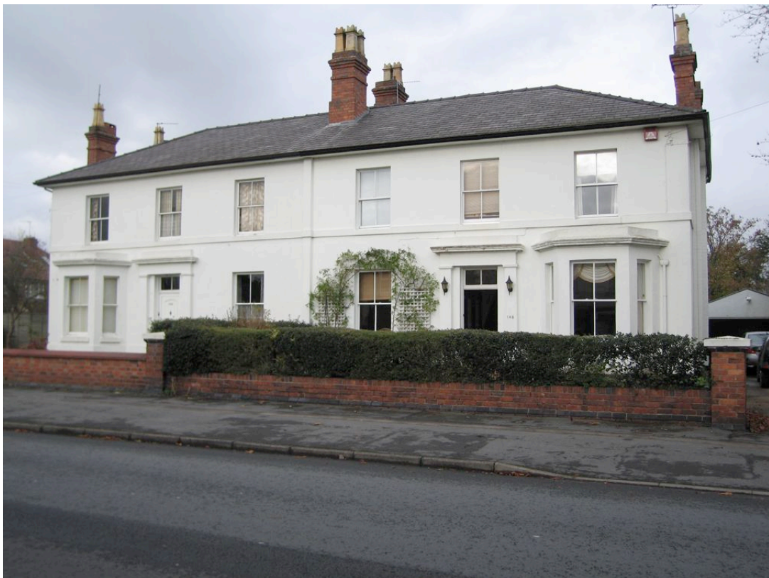
146 Hurcott Road, on the right of the pair, pictured in 2007

Lister was buying a plot on Hurcott Road with 1026 square yards, presumably the plot originally allocated to Thomas Smith in 1851. He also bought land occupying the corner of Hurcott Road and Batham Street containing 4642 square yards, which the plan shows to have been formerly four distinct plots. One of them was the plot allocated to Cumming. The two houses 145 and 146 Hurcott Road were to be built by 1872 and the property was to remain with the Lister family until 1952.