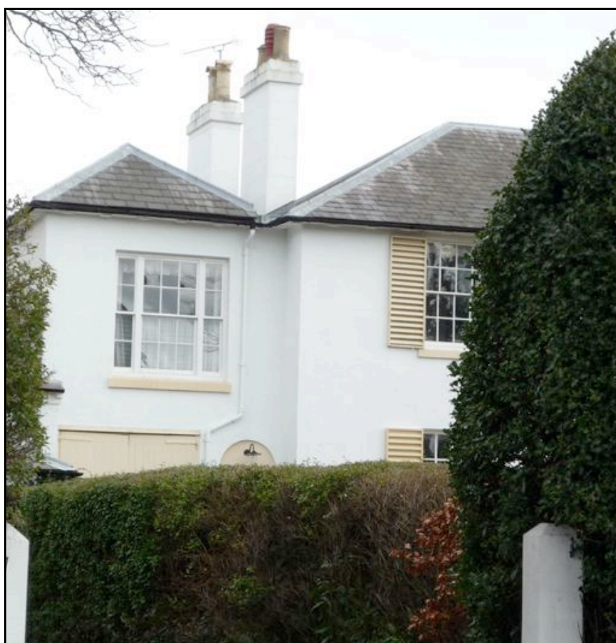
Detail of front of 19 Blakebrook in 2008