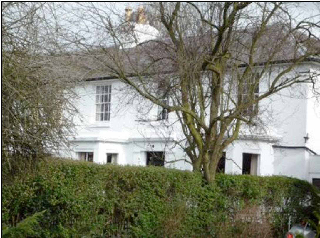
19 Blakebrook pictured in 2009