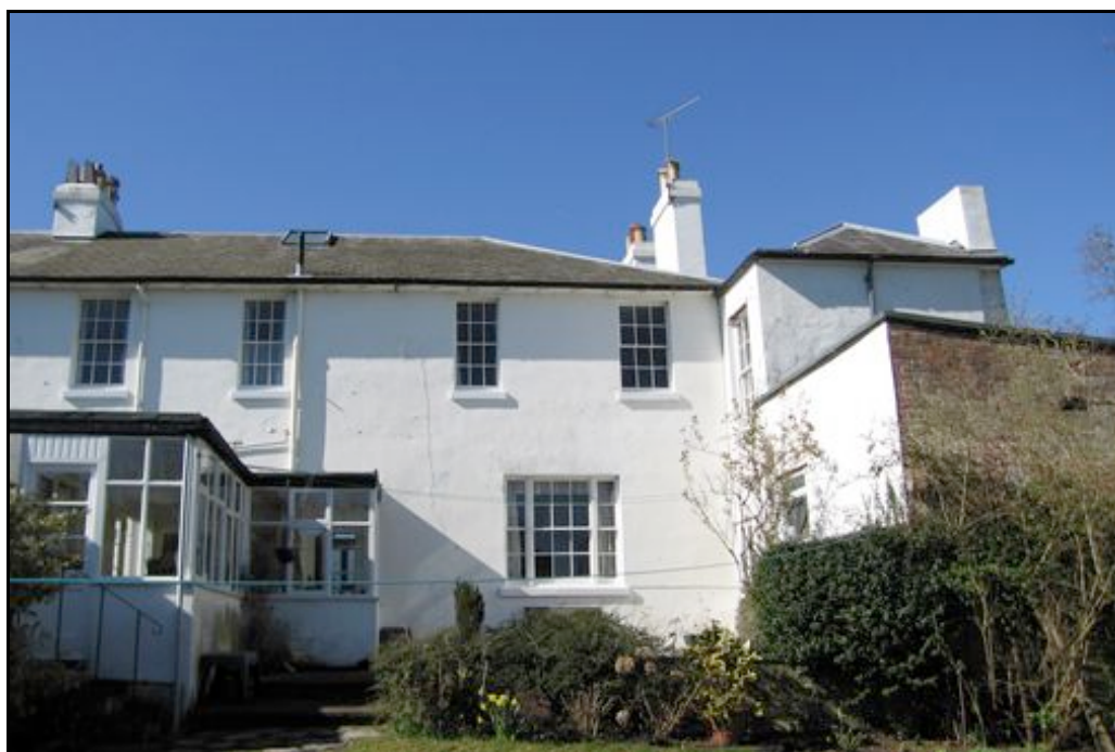
Rear of 18 Blakebrook in 2008

The 1835 codicil stated that the tenants of the houses now numbered 18 and 19 were George Crump and Joseph Hiles respectively. They were both carpet manufacturers. Hiles in fact had been the tenant of number 19 from the start.