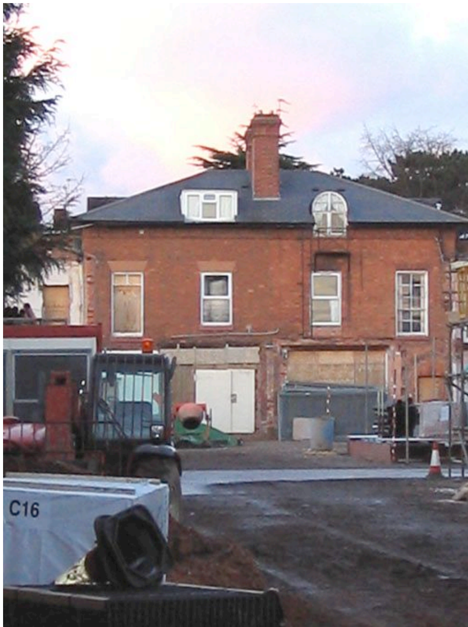
Rear, 194 & 195 Comberton Road following demolition of two rear wings Nicky Griffiths 1st March 2006

"each containing Entrance Hall, China Closet, Dining Room, 20ft. by 14ft.; Drawing Room, 13ft. 3 in. by 12ft. 9in.; Kitchen, Brewhouse, Cellars, Three Chambers on first floor, and Three Attics; with well-arranged Out Offices, Side Entrances, and large, productive, and well-planted Gardens. ... Lots 2 & 3 being in the respective occupations of Mr Amphlett and Mr Alfred Brinton, as yearly tenants, at a gross Rental of £70.