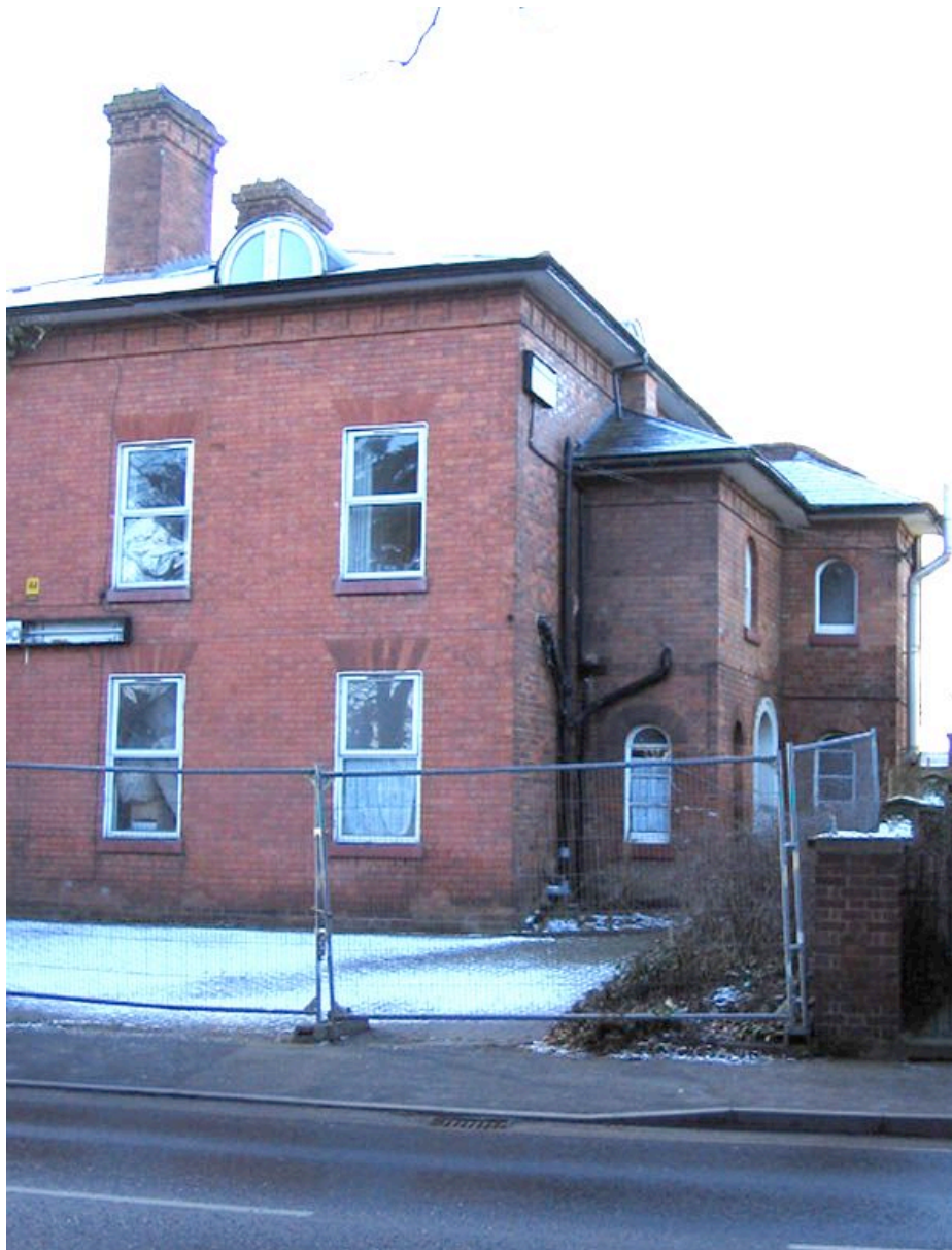
195 Comberton Road Nicky Griffiths 1st March 2006

entrance door, in a round arched portal, was set in the side elevation of this first bay, with an arched window to the left of the door and set centrally at the first storey. The second bay had two of these narrow, round arched windows to its front elevation. This feature had been covered by a modern reception area to No 194 but could still be seen to the side of 195. A further arched dormer window was centrally set into the side plane of the main roof. Dentil friezes in brick ran around the building below the main roof and the roofs of the side bays. This pattern was repeated on the two centrally situated chimney stacks. There were two more arched dormer windows in the rear of the hipped main roof.