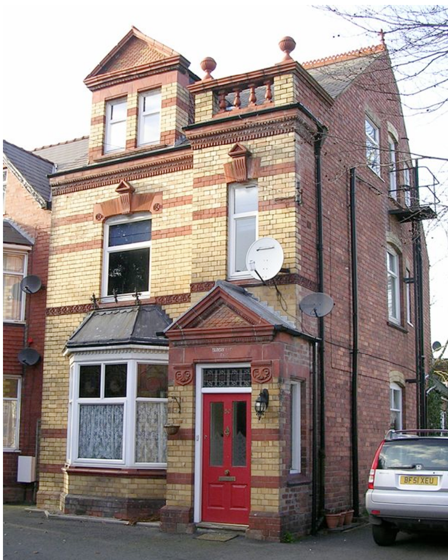
Figure 1. Elderfield Lodge, Elderfield Gardens.

Elderfield Lodge is at the top of Coventry St next to the property 'Elderfield'. It is part of an elegant row of houses approached by a side road overlooking Coventry St and St George's Church. The row of eight properties goes under the collective name of 'Elderfield Gardens'.