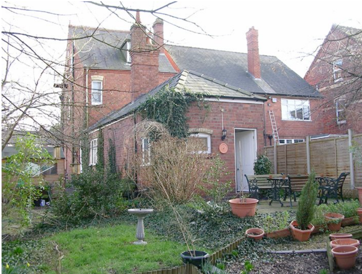
Figure 2. Rear view of Elderfield Lodge.

The side and rear of the property are much plainer than the front, although the standard red brick construction is alleviated just a little by the use of yellow bricks for over-window segmental lintels. A plain dormer projecting from the slated roof provides a view out to the rear from the second floor. The single storey outhouse facilities are original to the property.