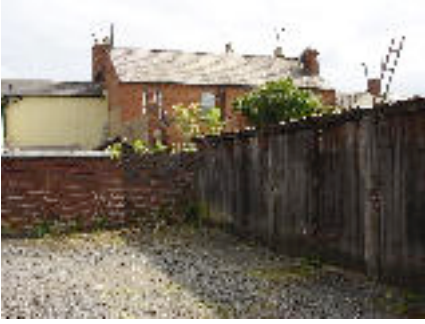
Rear of 21 Habberley Street