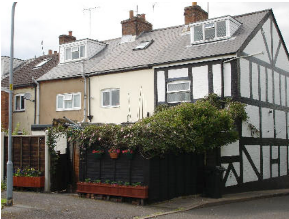
Rear of Nos 2-4 Habberley Street on the south side of the road.

These constitute the last houses to be built in Habberley Street which has remained the same until the redevelopment when No 1 was lost from the south side of the street at the Proud Cross ringway end. Also The Alma pub No 7 was redeveloped with Nos 7A, 7B, and 7C but its adjoining building No 8 remains but shows a newly constructed brick retaining wall. There are also new houses built on land between No 8 and No 9 which are 8A, 8B, 8C & 8D.