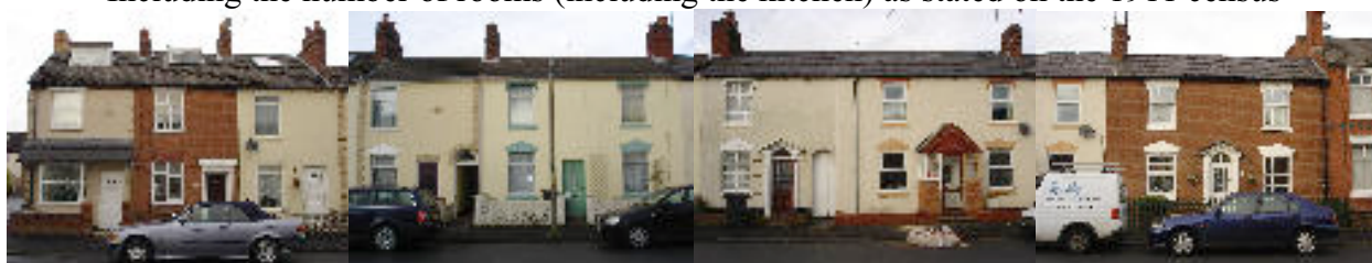
Nos 13-15 5 Rooms in 1911 Built between 1851 & 1859

Including the number of rooms (including the kitchen) as stated on the 1911 census