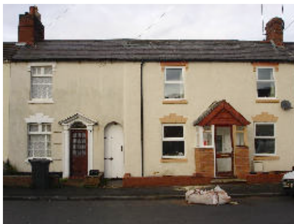
Nos 18 & 19, of which No 19 appears on the 1841 Census and No 18 was added later.

We know that these houses were the ones on the 1841 census and some in the rate books, because the same occupants were in some of them several censuses afterwards.