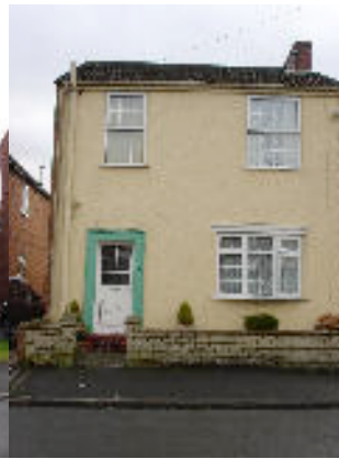
No 8 Habberley Street South side of the street Built pre 1841