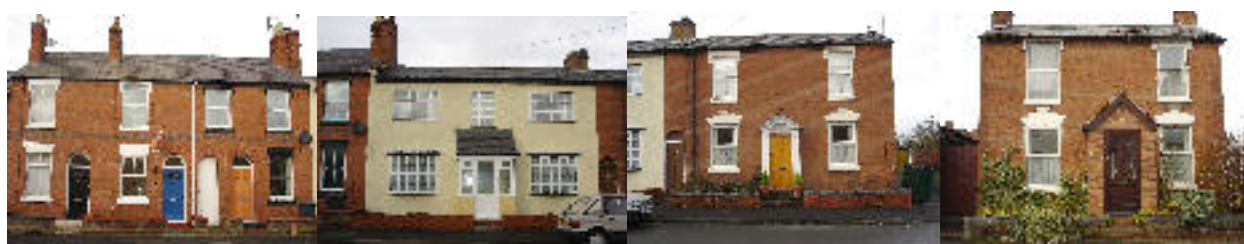
Nos 21-23 4 Rooms in 1911 Built in 1880/1881