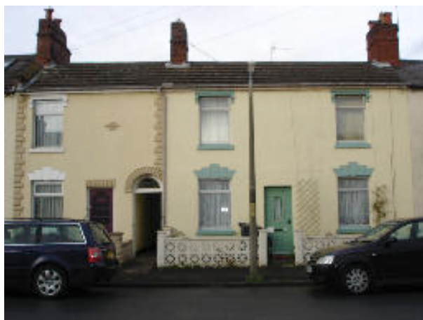
Nos 16 & 17, of which 17 appears on the 1841 Census, and No 16 was added later.