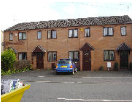
Nos 8a, 8b, 8c & 8d Habberley Street South side of the street Built post re-development about 1990