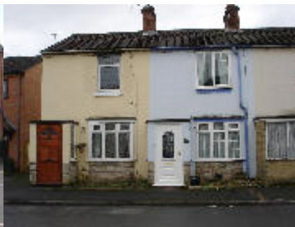
Nos 9 & 10 Habberley Street South side of the street Built between 1851 & 1861