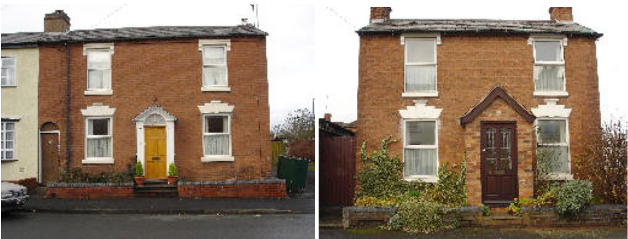
No. 25, (No. 22 in 1841) and No. 26 (No. 23 in 1841) were also built at the same time around 1837.