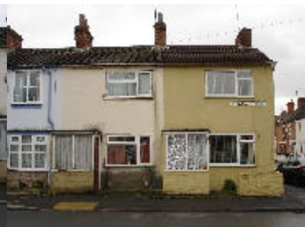
Nos 11 & 12 Habberley Street South side of the street butting on to Crane Street