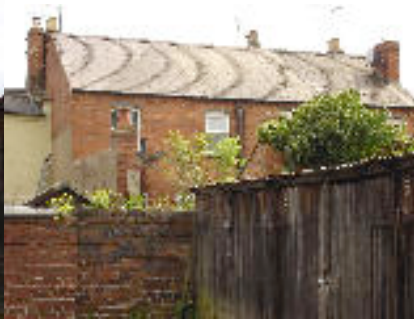
Rear of Nos 23 & 22 Habberley Street