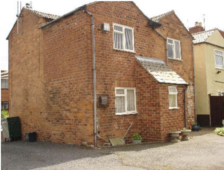
Rear of 25 Habberley Street on the North side of the street

The houses were renumbered after the 1881 census to accommodate the 3 new houses built between the old number 20 and 23. On the 1911 and most recent census there are 26 houses in total. They now are numbered 2-12 on the south side, and 13-26 on the north side.