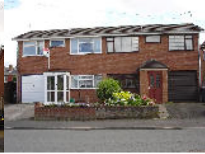
Nos 6A & 6B Habberley Street South side of the street Built post re-development in about 1990