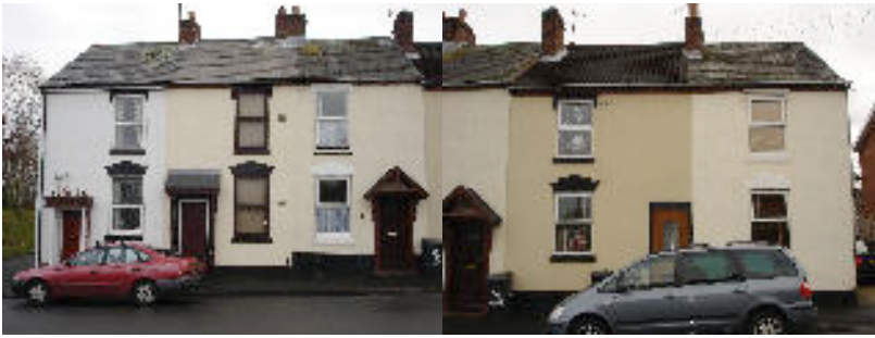
Nos 2 – 4 Habberley Street South side of the street nearest to Proud Cross Ringway Built pre 1841 (plus No 1 which was demolished with the redevelopment)