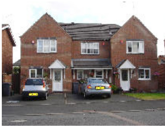
Nos 7, 7A & 7B Alma Court Habberley Street South side of the street Built post re-development about 1990