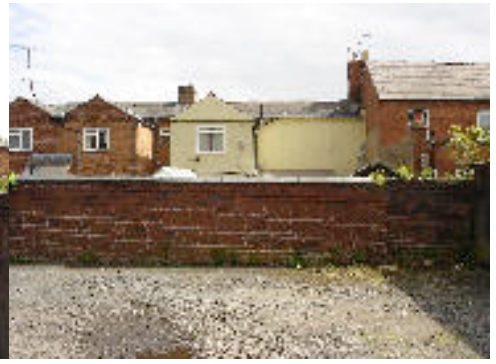
Rear of 24 Habberley Street