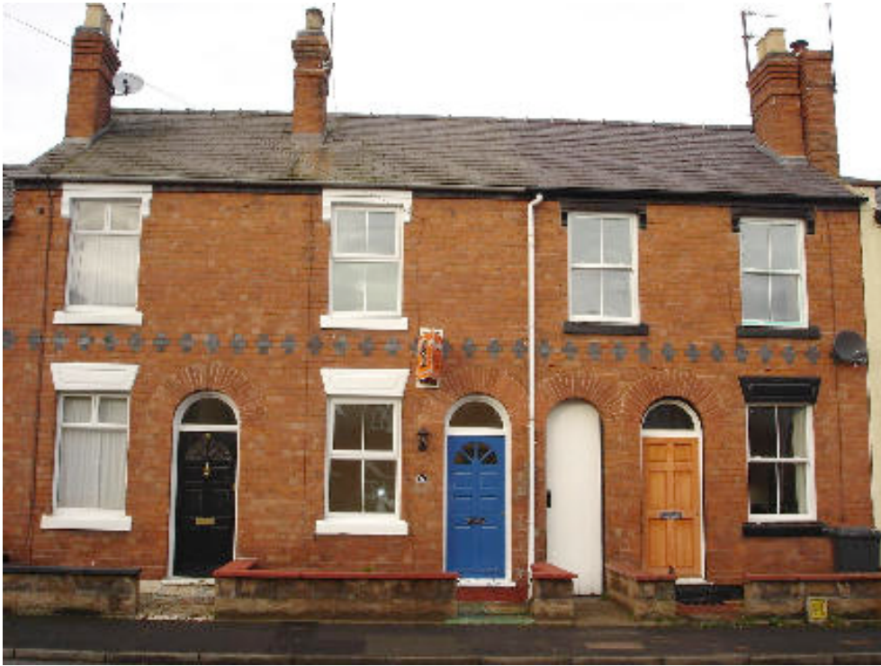
Nos 21-23 Habberley Street, (on the north side of the street), were built in 1880/1881. They may have been built under the Alma Land Club scheme which had been instituted in 1878.

These constitute the last houses to be built in Habberley Street which has remained the same until the redevelopment when No 1 was lost from the south side of the street at the Proud Cross ringway end. Also The Alma pub No 7 was redeveloped with Nos 7A, 7B, and 7C but its adjoining building No 8 remains but shows a newly constructed brick retaining wall. There are also new houses built on land between No 8 and No 9 which are 8A, 8B, 8C & 8D.