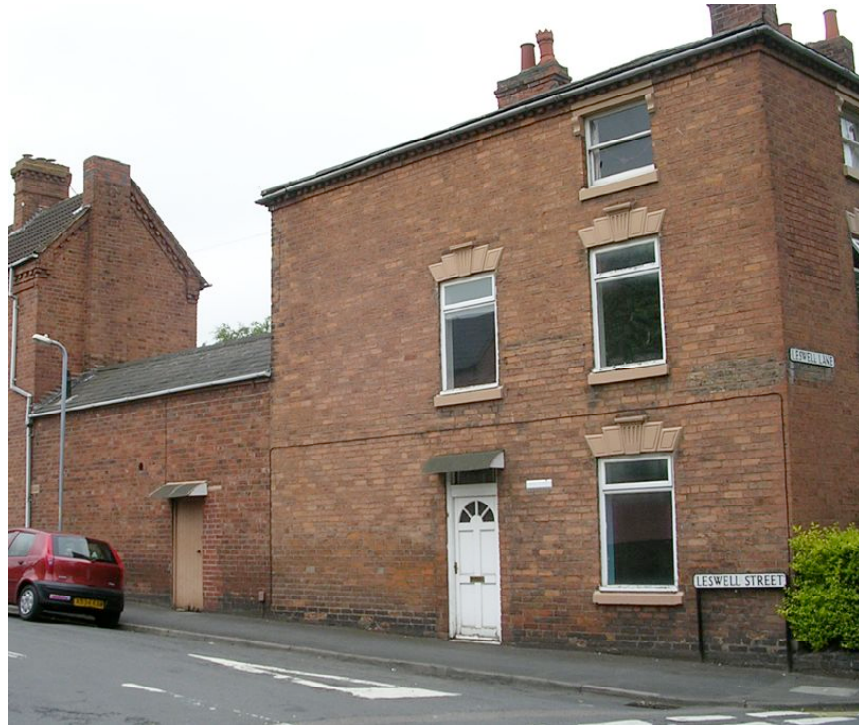
Fig. 1. 2 Leswell St, was the 'Lion & Lamb' in the 1850's. (Bob Millward 7 June 2007)