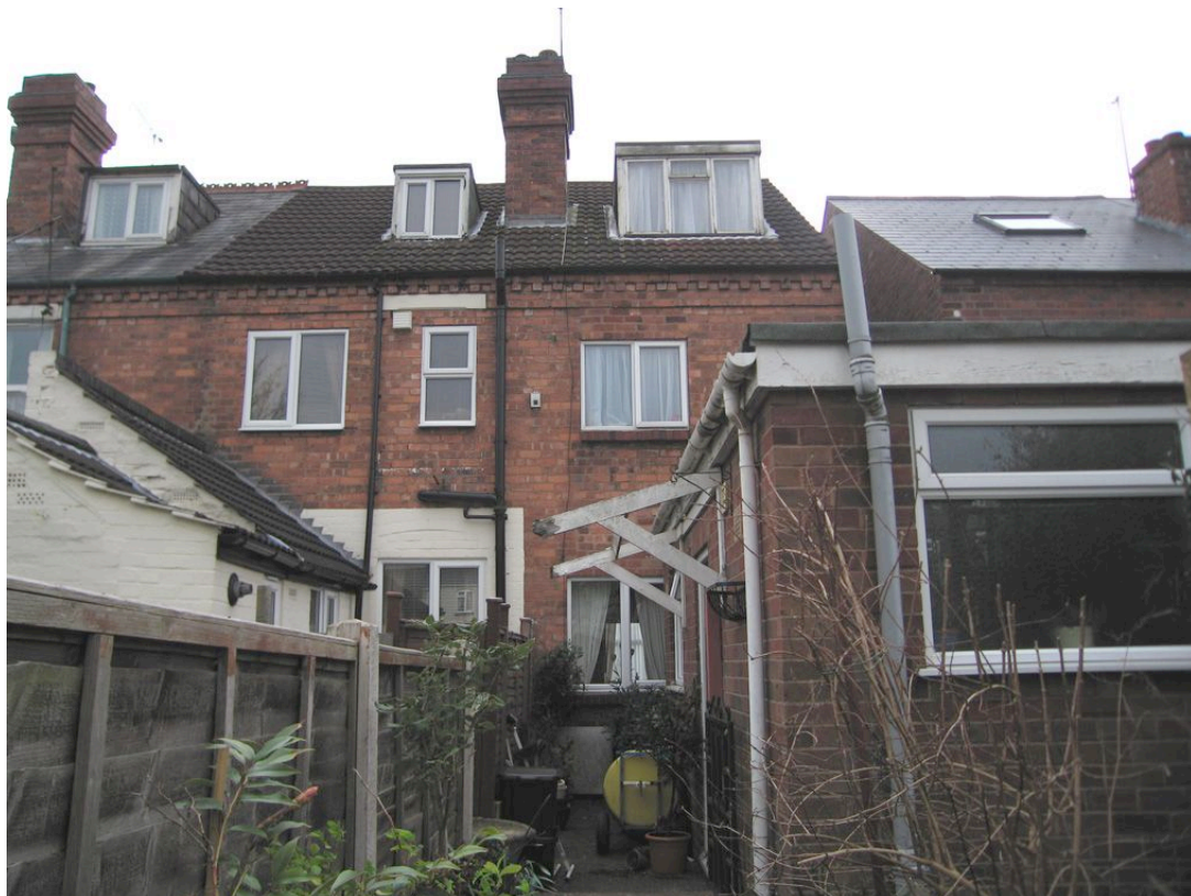
Rear of 59-62 Peel Street in 2007