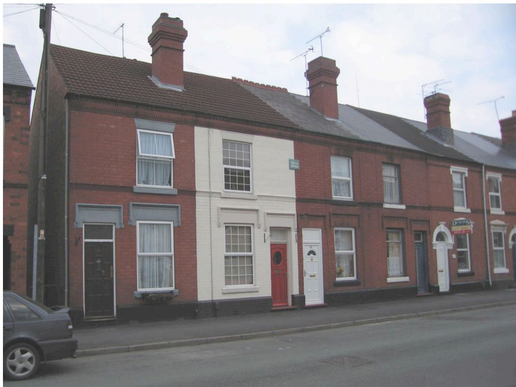
59-62 Peel Street in 2007 with stone 'Myrtle Cottages'

It should not be thought that the Society was dissolved because the streets were fully developed. On the contrary, it is likely that many plots had not been built upon. We know that the property which is the subject of this report had no houses on it for another decade after the winding up of the Society. Also the 1885 OS map, surveyed in 1883, shows perhaps only 26 out of 92 plots with houses on them.