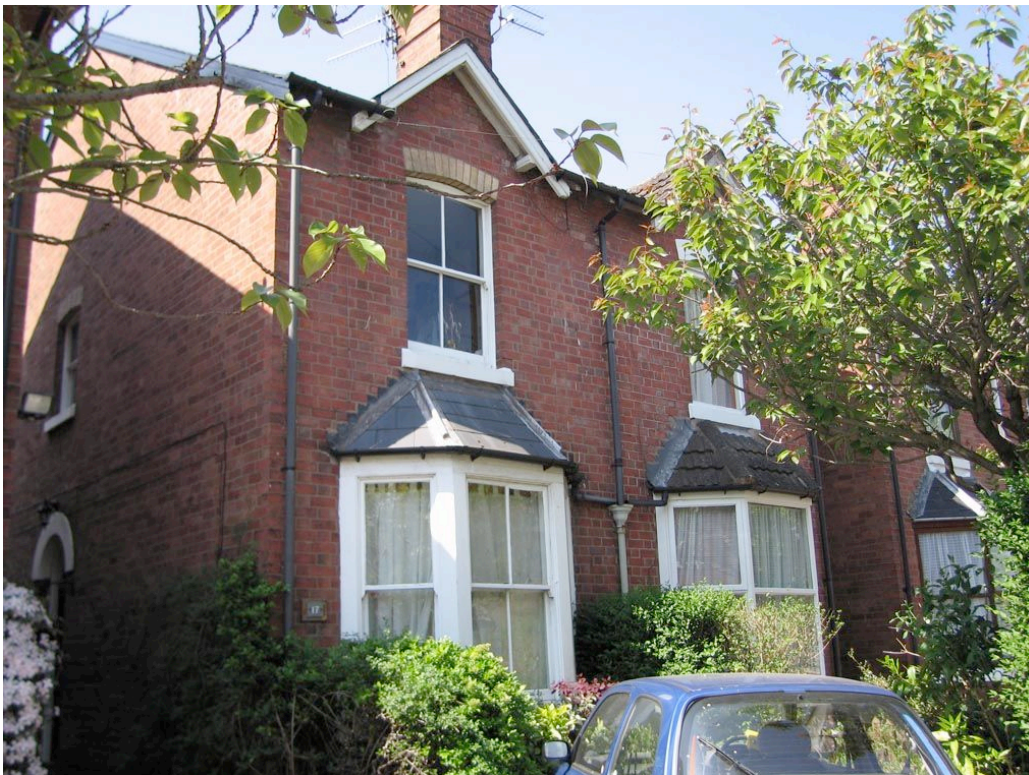
17 Shrubbery St in 2007

The Shrubbery Land Society was formed in 1873. Its object was to raise a fund to purchase White's Field, which was to be divided into 38 or more lots for conveyance to members. Subscriptions were ten shillings per share payable every fourth Tuesday. A plan of the Society's land five plots on each side of Shrubbery Street fronting Birmingham Road and a further 14 plots on each side of Shrubbery Street itself. (WRO BA 5278/32)