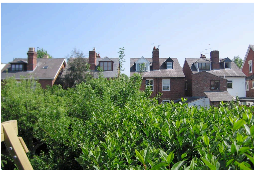
A rear view of the four pairs of houses built together