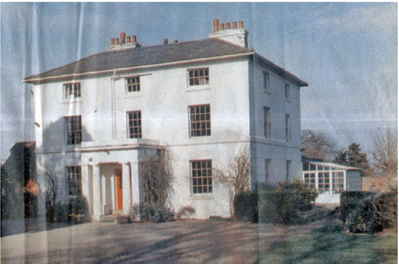
Trimpley House 2000