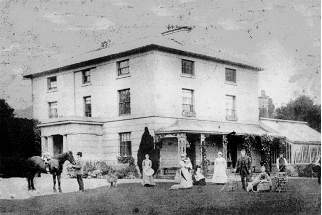
Trimpley House c1910