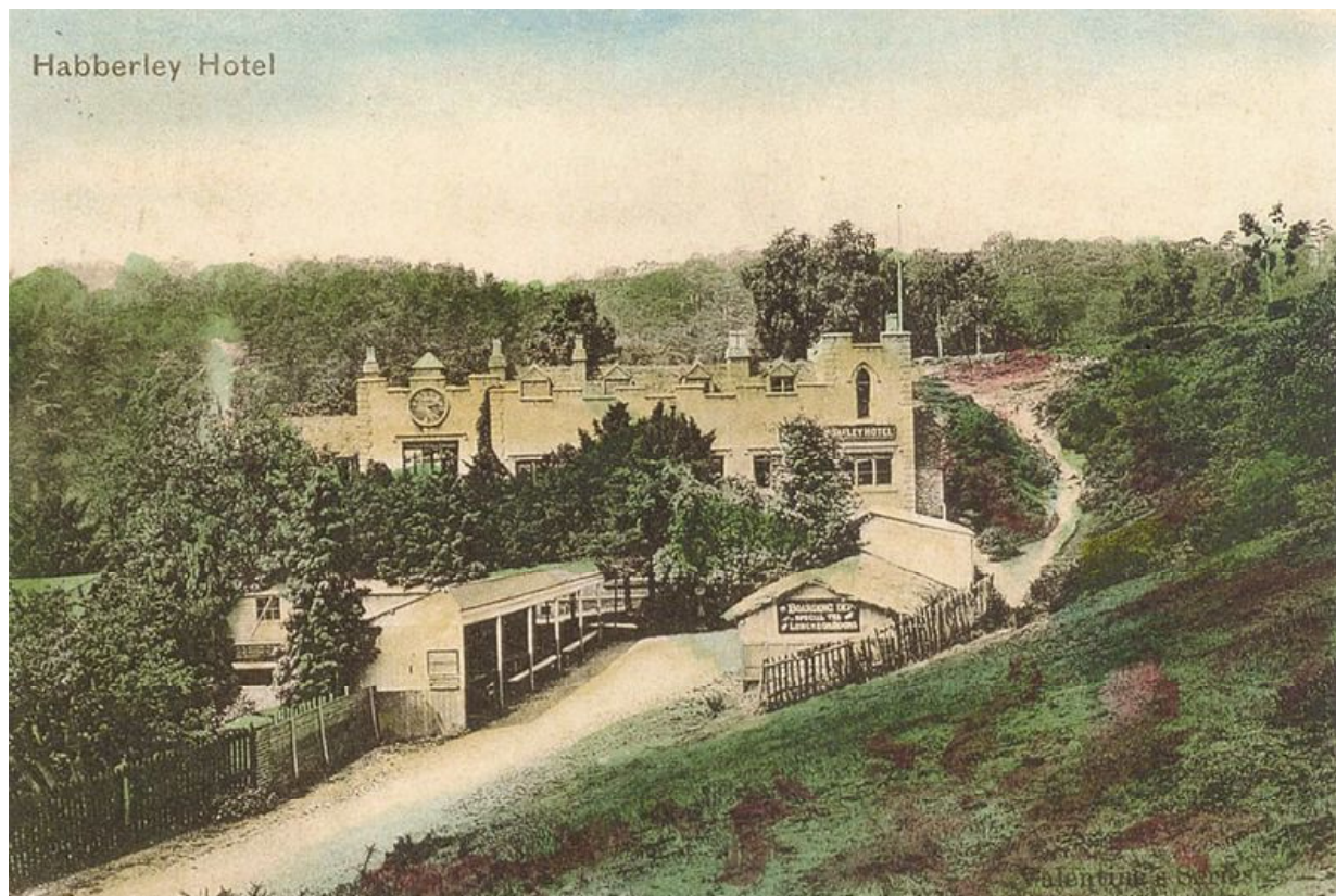
Habberley Valley Hotel 1904 (Valentine Postcard series)