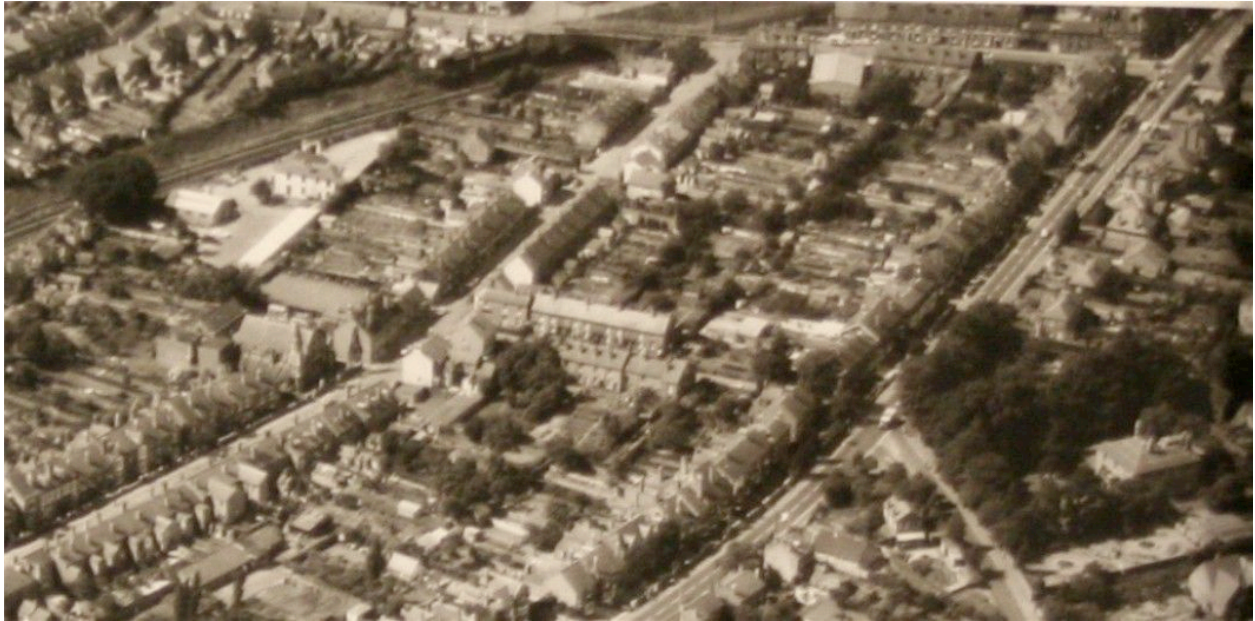
Aerial photograph AE SCH Acc 73 Yew Tree House plot is in the pale triangle upper left.